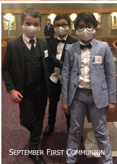
SEPTEMBER FIRST COMMUNION