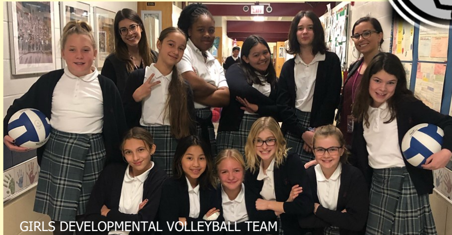
GIRLS DEVELOPMENTAL VOLLEYBALL TEAM