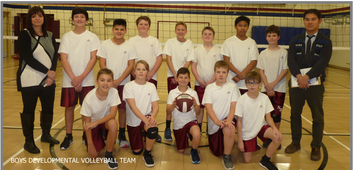
BOYS DEVELOPMENTAL VOLLEYBALL TEAM