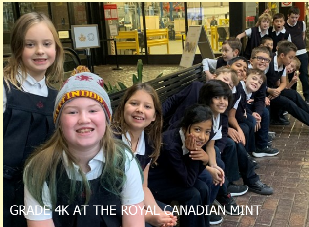
GRADE 4K AT THE ROYAL CANADIAN MINT