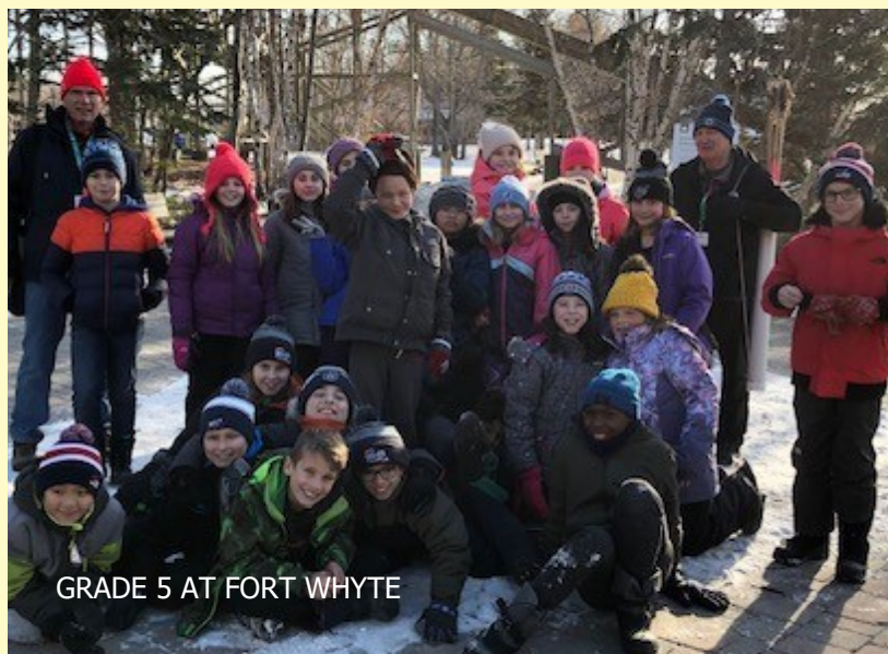
GRADE 5 AT FORT WHYTE