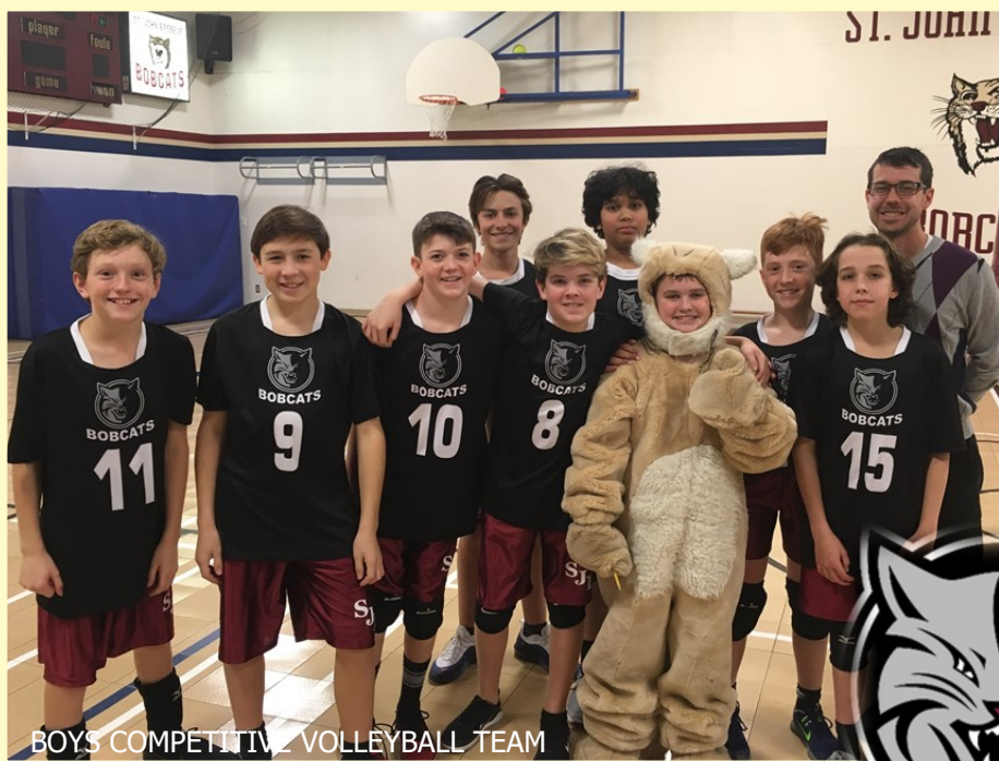
BOYS COMPETITIVE VOLLEYBALL TEAM