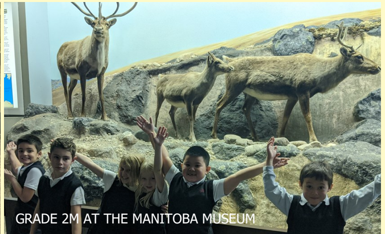
GRADE 2M AT THE MANITOBA MUSEUM