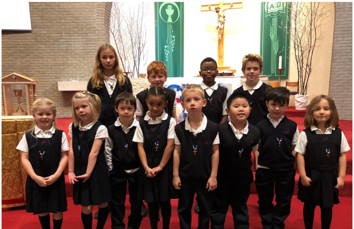
STUDENTS RECEIVING THEIR VIRTUES CROSS DURING THE FIRST SCHOOL MASS OF THE YEAR.