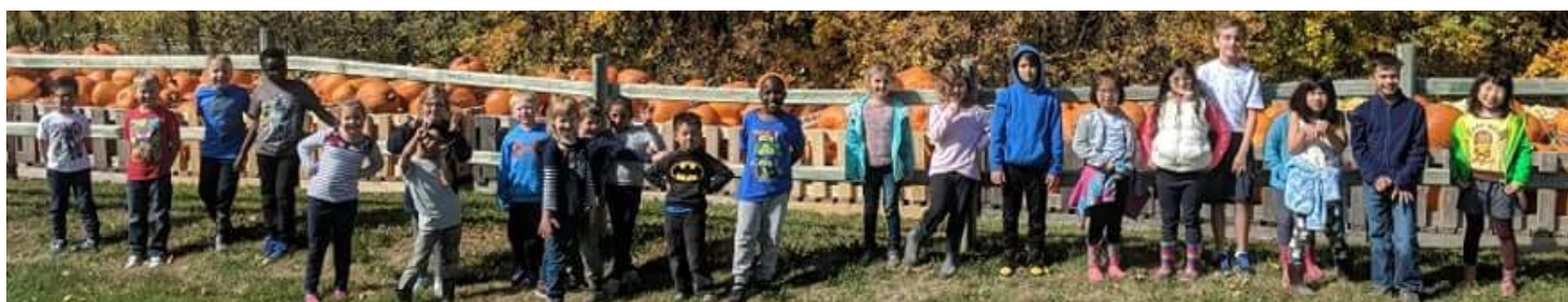
GRADE 2 FIELD TRIP TO A MAZE IN CORN