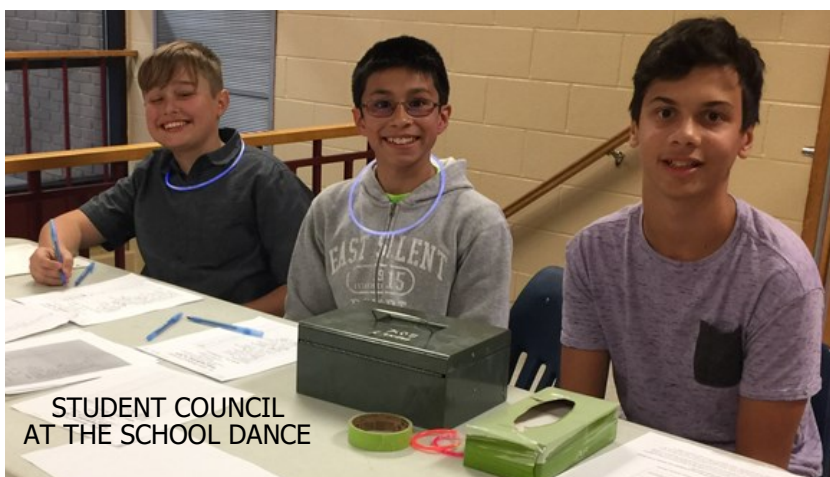
STUDENT COUNCIL AT THE SCHOOL DANCE