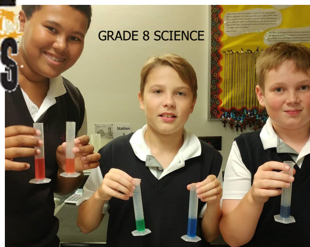
GRADE 8 SCIENCE