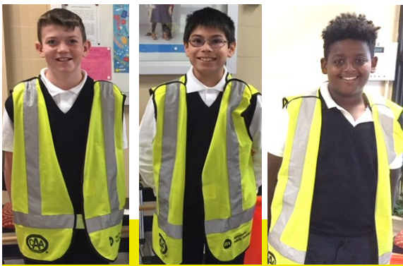
SCHOOL SAFETY PAROLS