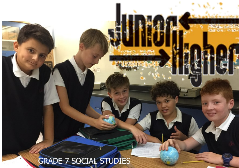
GRADE 7 SOCIAL STUDIES