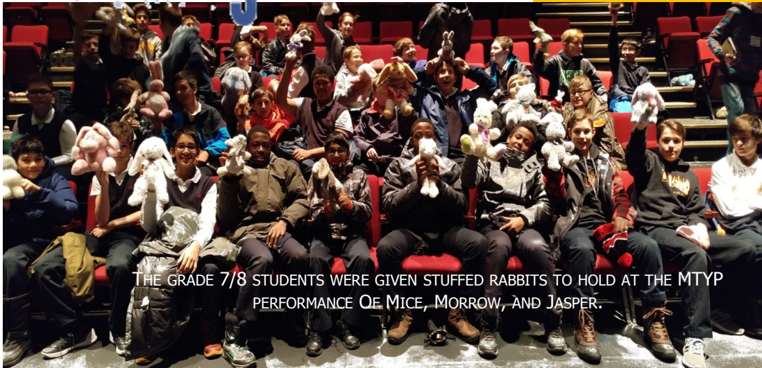
THE GRADE 7/8 STUDENTS WERE GIVEN STUFFED RABBITS TO HOLD AT THE MTYP PERFORMANCE OF MICE, MORROW, AND JASPER.