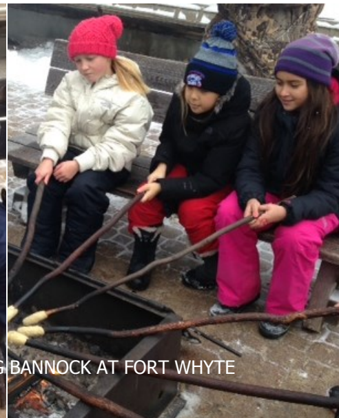
GRADE 5 MAKING BANNOCK AT FORT WHYTE